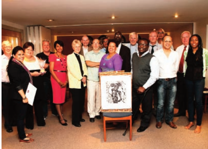
Westminster Central Hall Birthday signing.