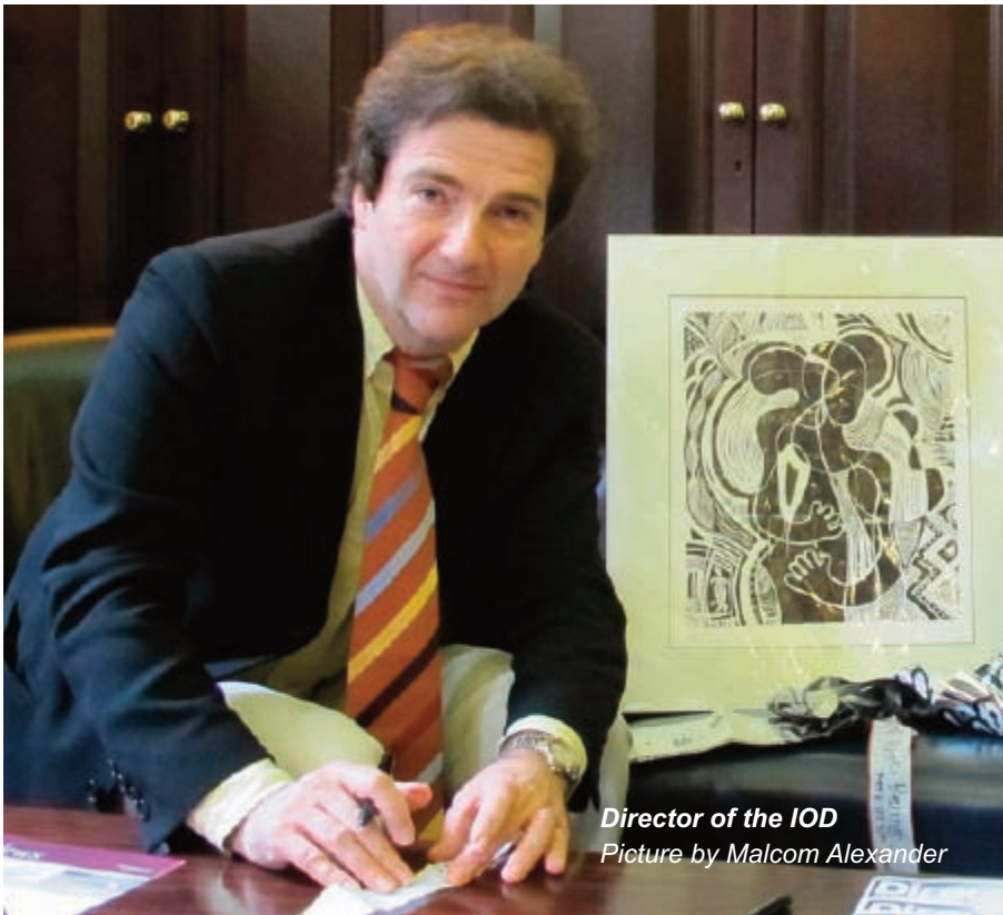
Director of the IOD